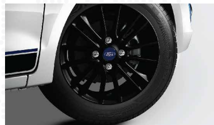
R15 (195/55 R15) Alloy Wheels

The sporty cellular grille gives a smart, bold look to the Ford Figo.