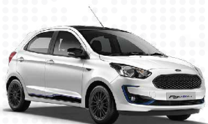
Figo Titanium BLU - Diamond White