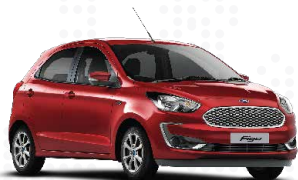
Figo Titanium - Ruby Red