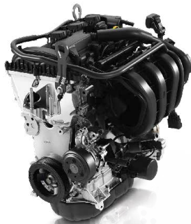
1.2l Ti-VCT Petrol Engine