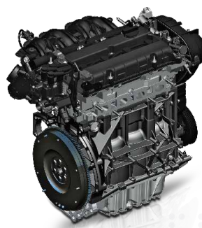
1.5l TDCi Diesel Engine