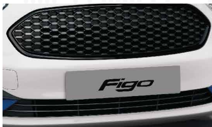
Sporty Cellular Grille

Contrasting colours on the roof make the Ford Figo a sight to behold.