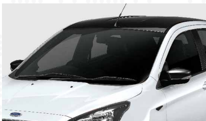
Dual Tone Roof

The Ford Figo's energetic design complements your personality and the hint of blue adds life to your world. Making it a smart match for you!