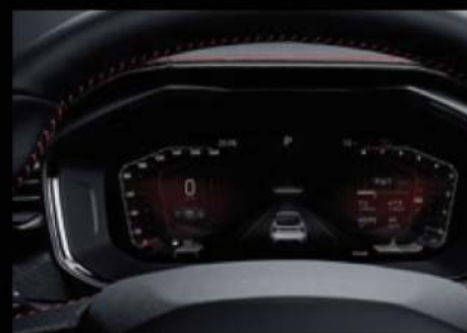
12.3-in. HD Digital Instrument Cluster