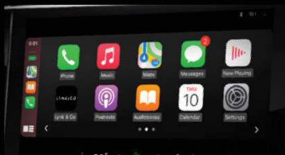
Apple CarPlay & Android Auto

MORE THAN ONE CAN THINK OF. ALL, JUST MY USUAL