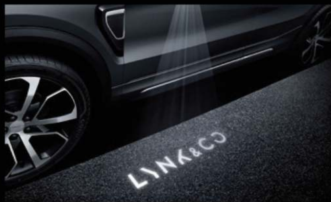
Welcome Ambient Light