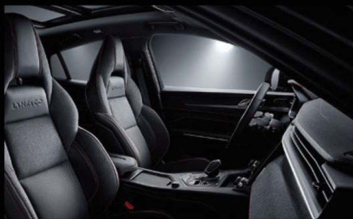
Integrated Sporty Premium Seats