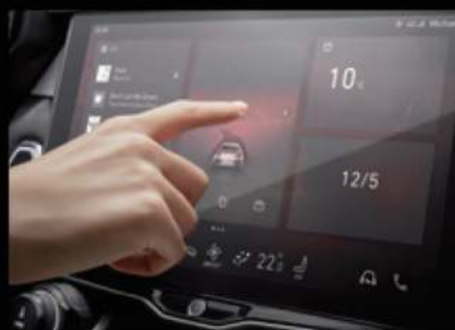
12.7-in. Touchable Center Stack