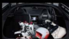
High-capacity Storage Space