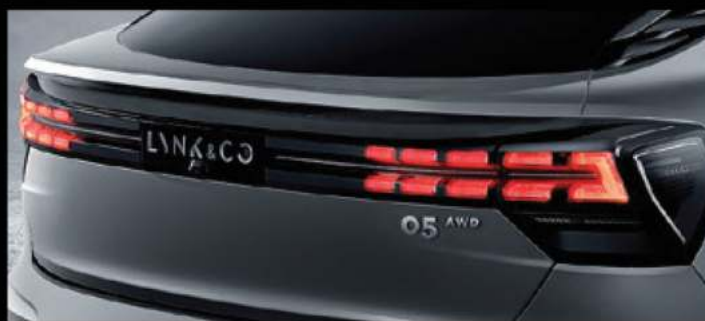
Energy Cube LED Rear Combination Lamps