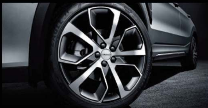
Silver Blade 20-inch Wheel Rim