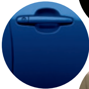
8P4 Indigo Ink 1,3,4