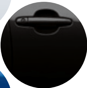
209 Black Sand Pearl 1,3,4