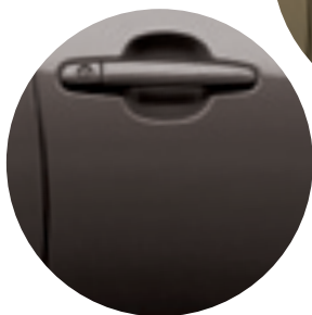
1E3 Phantom Grey Pearl 1,3,4