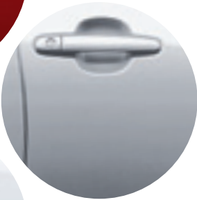
1E7 Silver Streak Mica 1,3,4