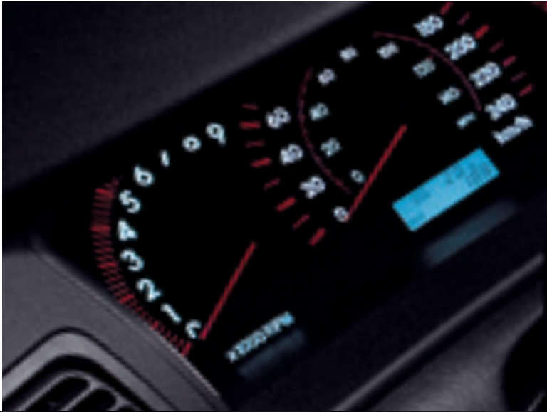
Right: Optitron Electronic Gauges – standard on XRS and LE.

Preceding spread: Corolla XRS shown in Phantom Grey Pearl.