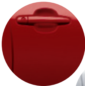
3P1 Impulse Red 1,3,4