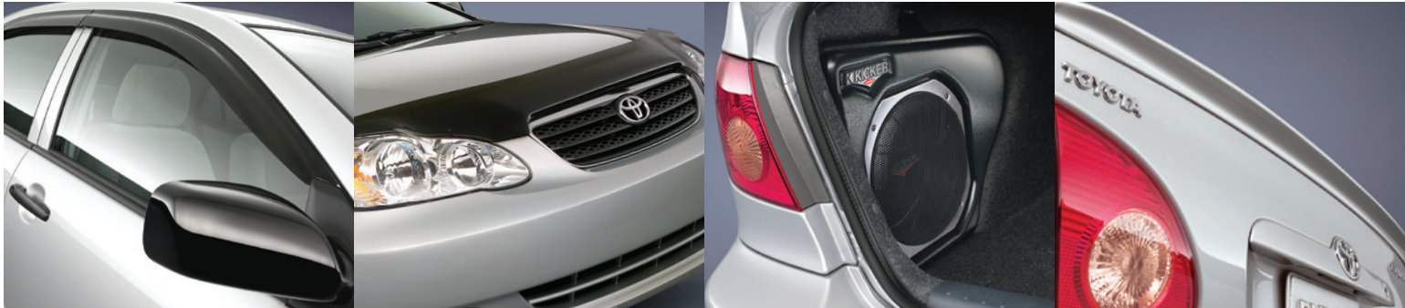
Side window visors

DRESS IT UP. DRIVE IT OUT. Express yourself. Take your Toyota Corolla to a whole new level of self-expression by adding any of the Toyota Accessories custom designed for your model. It's a great way to personalize your new vehicle, optimize its appearance and enhance the performance all at the same time. Ask your Toyota Dealer. To find the Toyota Dealer nearest you go to toyota.ca or call 1-888-TOYOTA-8 .