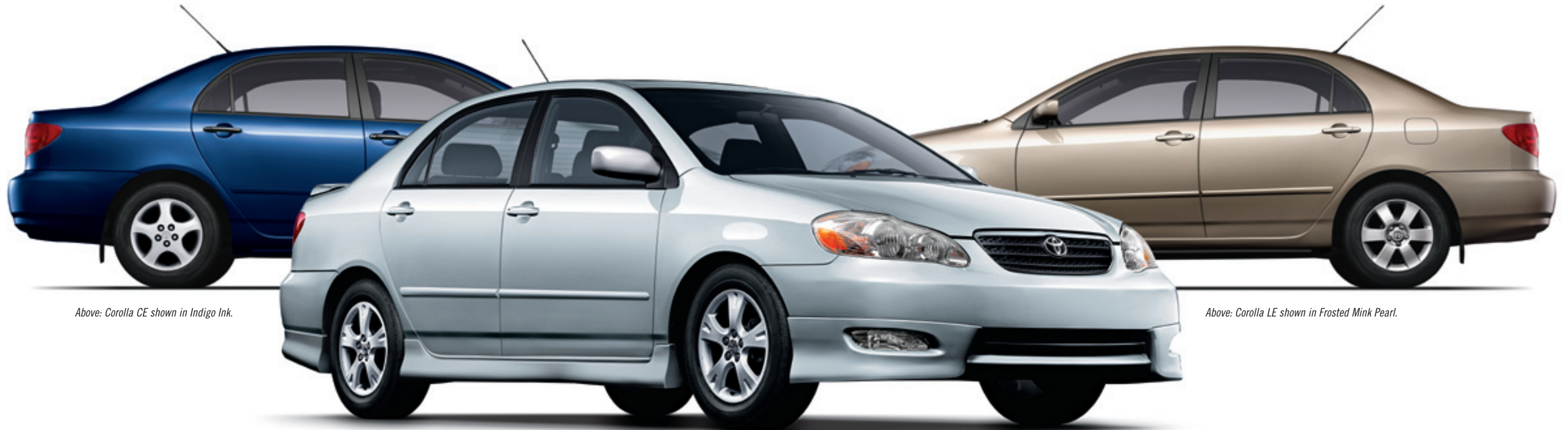
Above: Corolla CE shown in Indigo Ink.

TIME ISN'T THE ONLY THING THAT FLIES WHEN YOU'RE HAVING FUN.