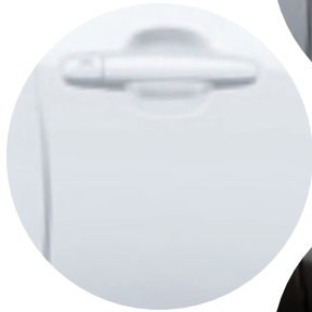
040 Alpine White 1,3,4