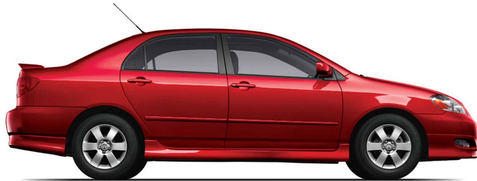
Above: Corolla Sport shown in Impulse Red.