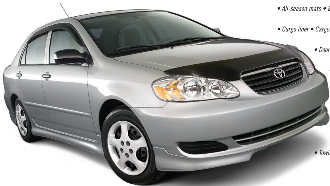
Corolla all dressed up with a rear lip spoiler, a hood deflector and a “body kit” which includes front and rear bumper chins and side skirts.