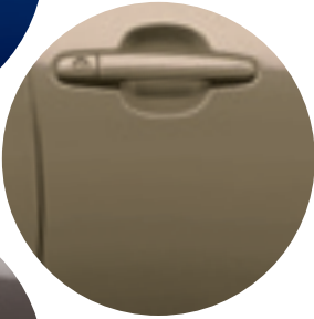
4Q2 Frosted Mink Pearl 2,3